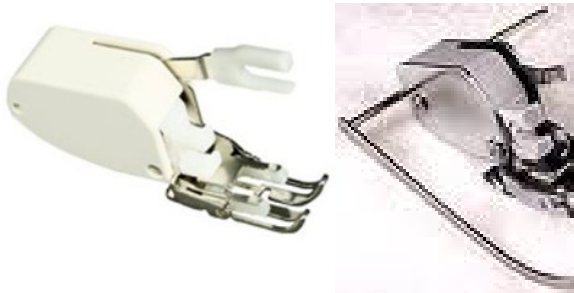
Walking foot or Even Feed Foot

-Feet for your machine -try both of these feet on your machine before class to be sure that you have the correct ones- if you don't have them, bring your machine to your dealer so that the proper foot can be